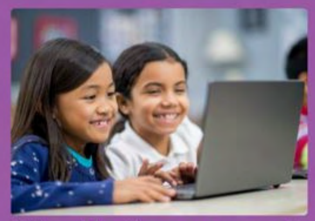
Calling all budding programmers to Code Club at Chatswood Library