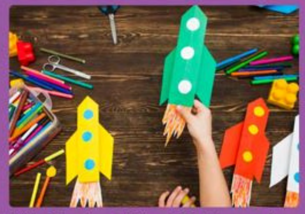
Kids Create at West Chatswood and Northbridge Libraries