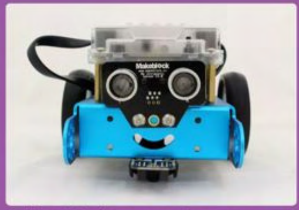
Self Guided Creator Kits: mBots at Chatswood Library