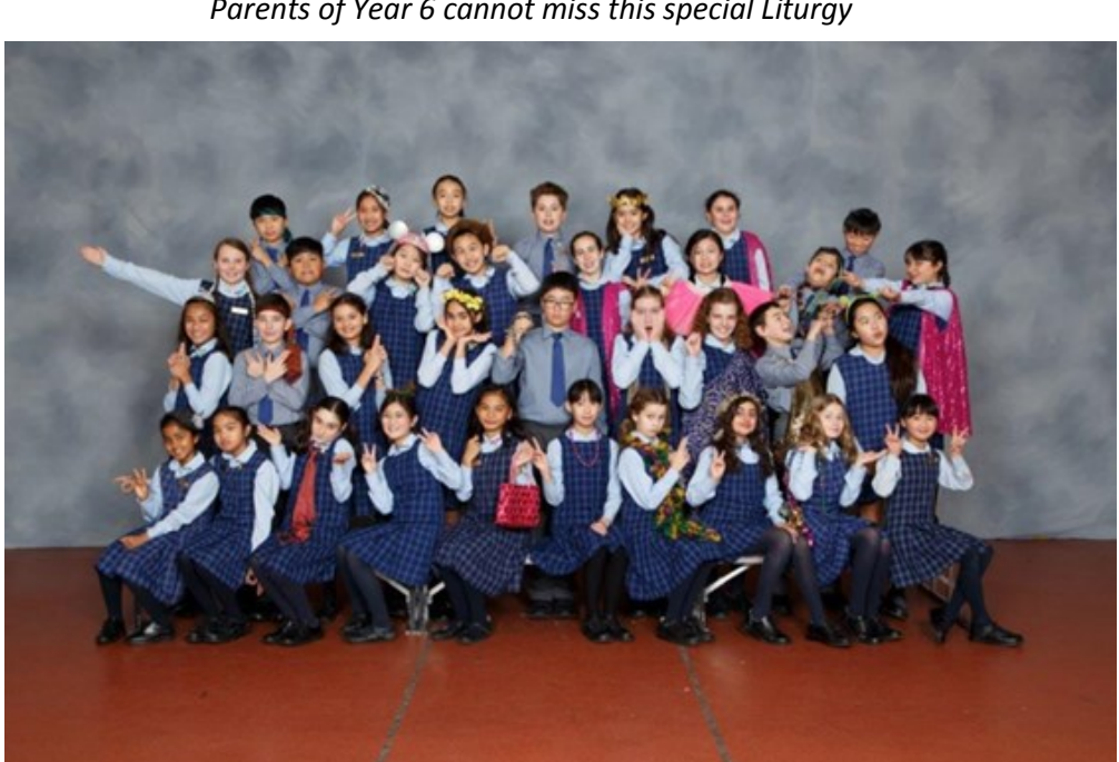
Parents of Year 6 cannot miss this special Liturgy

The WHOLE SCHOOL LITURGY FOR THE YEAR 6 GRADUATION IS ON THURSDAY 29<sup>TH</sup> OF NOVEMBER at 10am. This is a major school event and we hope the whole school community all turns out for this special occasion to celebrate the graduation of these beautiful students. They have led the school and cared for all students throughout the year, so your attendance and support would be most appreciated.